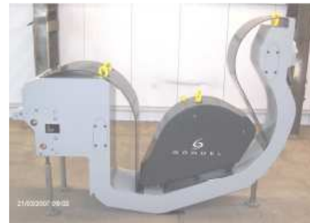
Divertor cassette mock-up