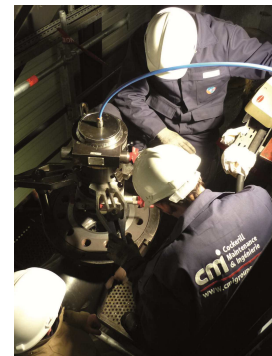
Site assembly and maintenance