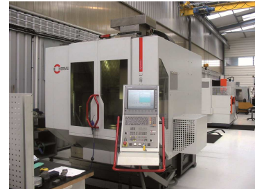
Clean (white) machine shop